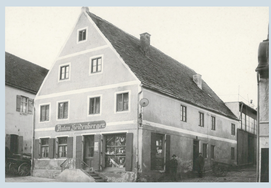
The old "Heidenberger's House", 1908